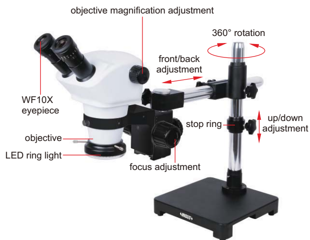
5106-M40 (with stand type A)